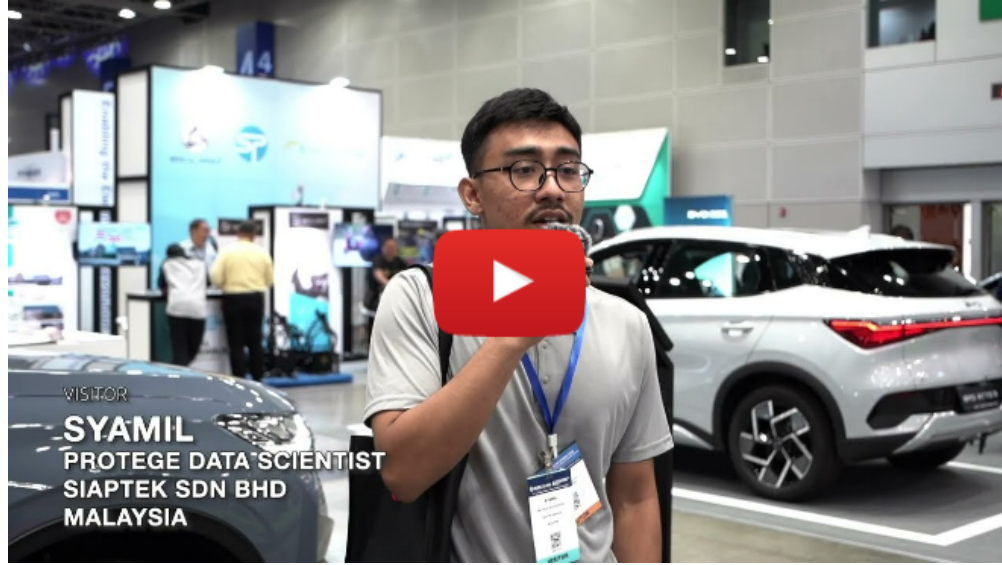
EMA Show Highlights - Day 1