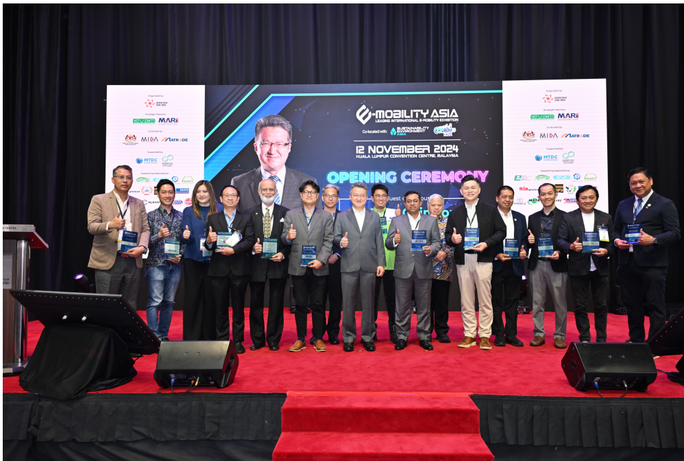
Opening Ceremony of E-Mobility Asia (EMA) 2024

E-Mobility Asia (EMA) 2024 returns from 12 – 14 November at the Kuala Lumpur Convention Centre . This event showcases the latest advancements in sustainable electromobility, featuring EV technologies, charging infrastructure, battery solutions, energy storage, logistics, and system providers.