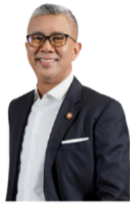
YB Senator Tengku Datuk Seri Utama Zafrul Bin Tengku Abdul Aziz

Minister of Ministry of Investment, Trade and Industry (MITI)