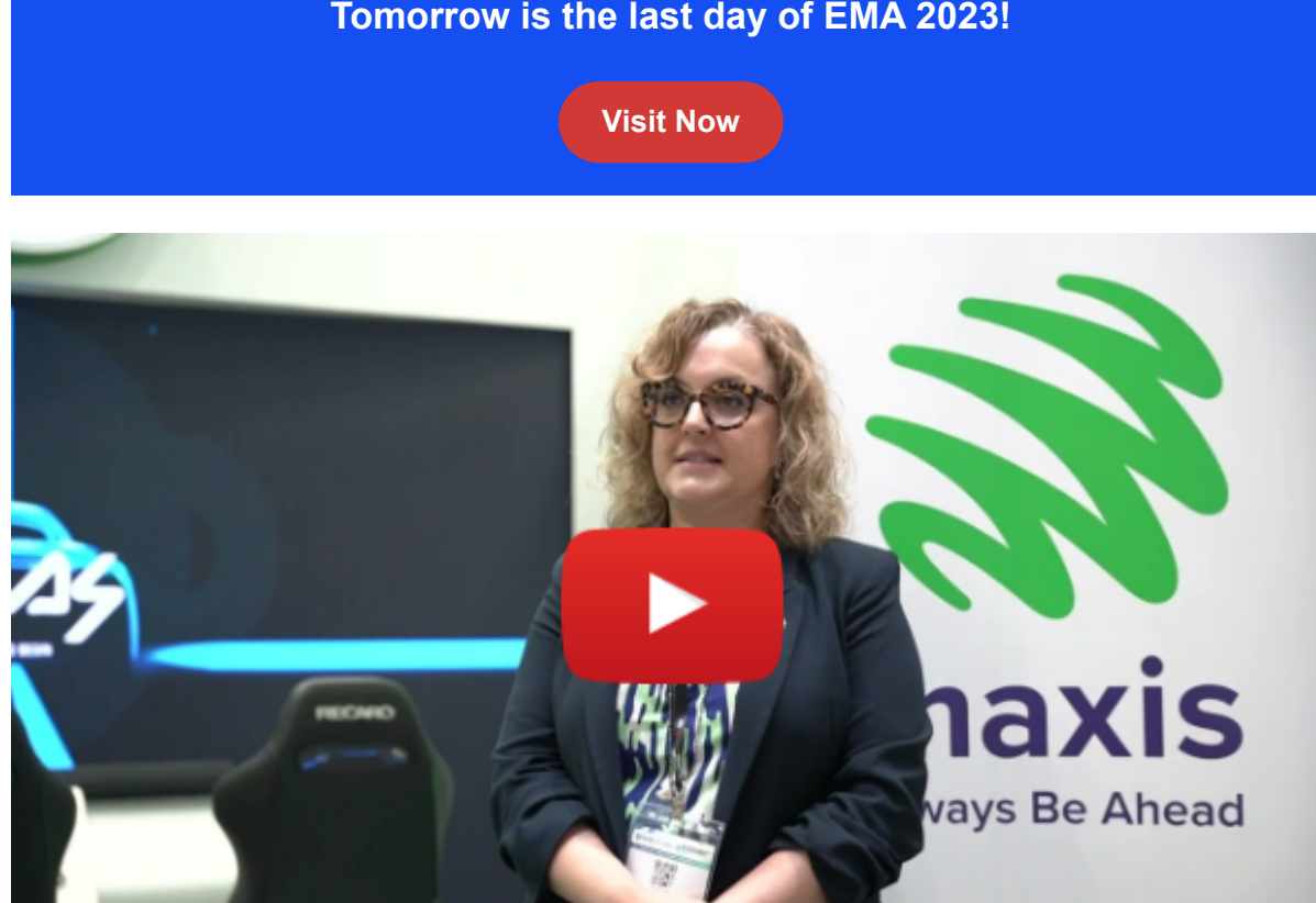
EMA Day 2 Show Highlights