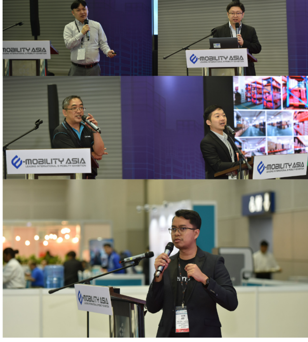
Technical Seminars by Nihon Denkei (M) Sdn Bhd, Innovative Green Power, Seel Electronic & Engineering Sdn Bhd, Emerald Auto Parts Sdn Bhd and EMoovit Technology Sdn Bhd